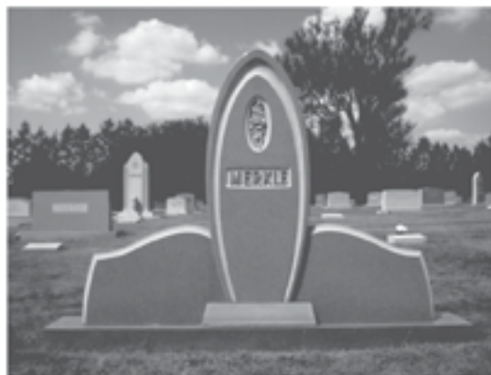
Family Owned Since 1933